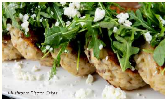
Mushroom Risotto Cakes