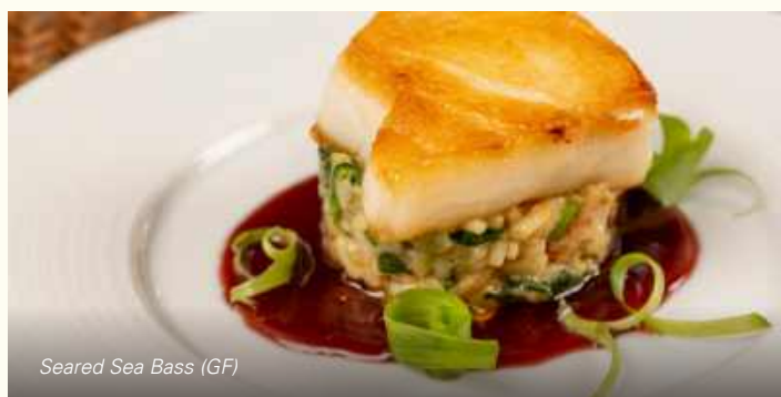
Seared Sea Bass (GF)