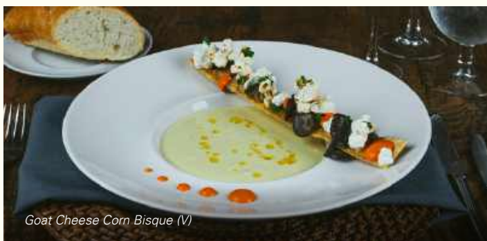
Goat Cheese Corn Bisque (V)