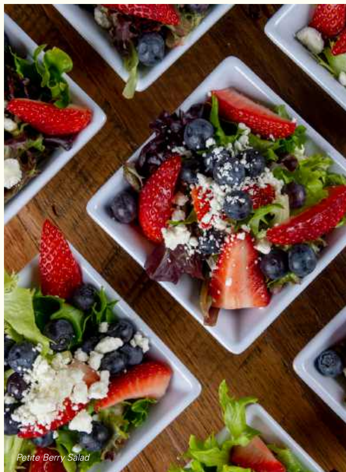
Petite Berry Salad