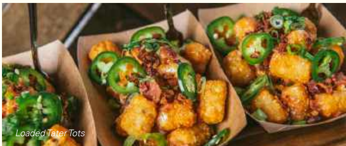
Loaded Tater Tots

Glazed Donuts Sautéed in Caramel Sauce & Chocolate Sauces with Sautéed Bananas Foster in a Cinnamon Butter Sauce