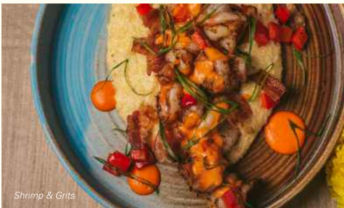
Shrimp & Grits