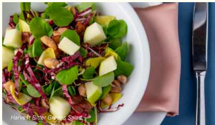
Harvest Bitter Greens Salad

*Consuming raw or undercooked meats, poultry, seafood, shellfish or eggs may increase your risk of foodborne illness. Beef & Tuna may be "cooked to order"