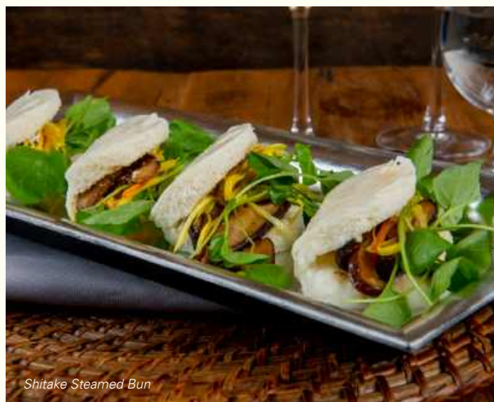
Shitake Steamed Bun