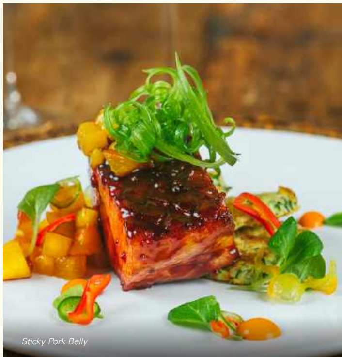
Sticky Pork Belly