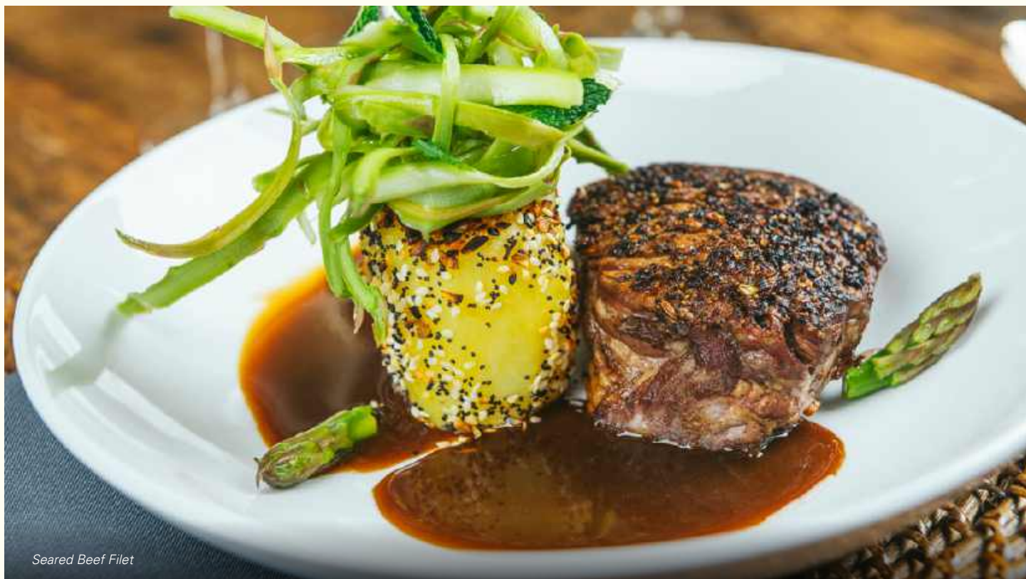
Seared Beef Filet