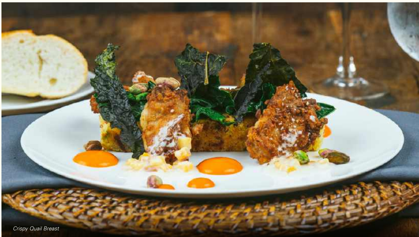
Crispy Quail Breast