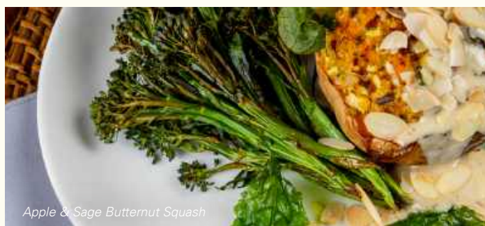
Apple & Sage Butternut Squash

*Consuming raw or undercooked meats, poultry, seafood, shellfish or eggs may increase your risk of foodborne illness. Beef & Tuna may be "cooked to order"