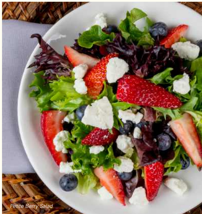
Petite Berry Salad

Baby Iceberg, Crumbled Blue Cheese, Bacon, Tomato, Red Onion & Buttermilk-Peppercorn Dressing