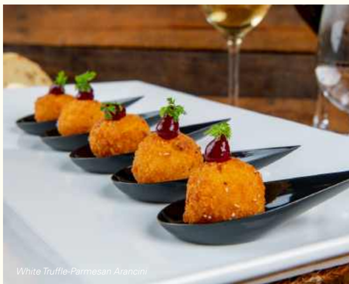
White Truffle-Parmesan Arancini