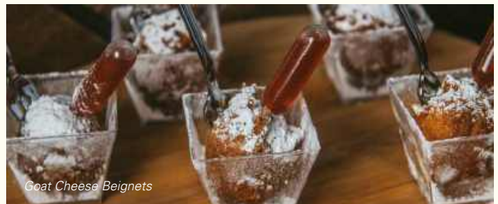
Goat Cheese Beignets

*Consuming raw or undercooked meats, poultry, seafood, shellfish or eggs may increase your risk of foodborne illness. Beef & Tuna may be "cooked to order"