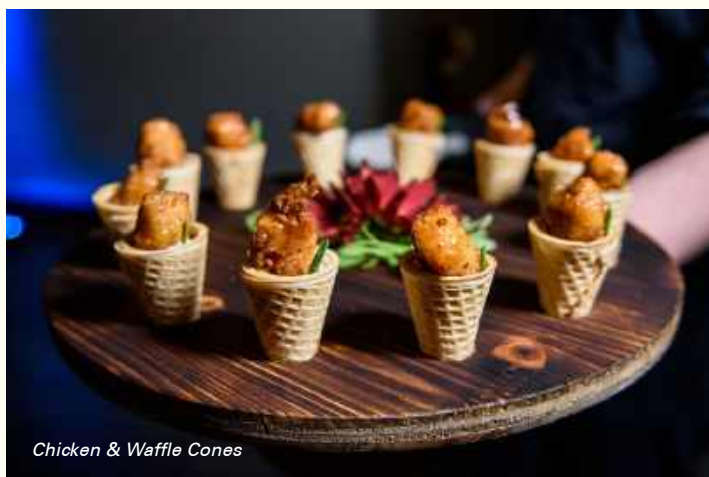
Chicken & Waffle Cones

Avocado Mousse, Everything Crumble, Oven Dried Tomatoes & Herbs