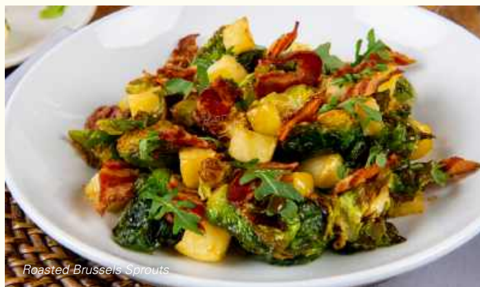
Roasted Brussels Sprouts

*Consuming raw or undercooked meats, poultry, seafood, shellfish or eggs may increase your risk of foodborne illness. Beef and Tuna may be "cooked to order"