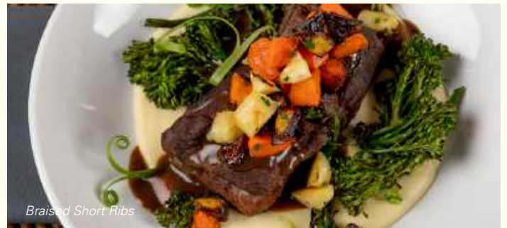
Braised Short Ribs