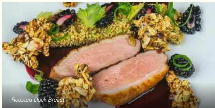
Roasted Duck Breast