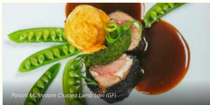
Porcini Mushroom Crusted Lamb Loin (GF)