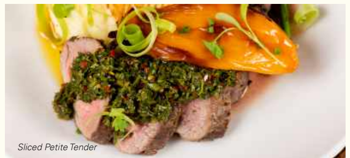
Sliced Petite Tender

*Consuming raw or undercooked meats, poultry, seafood, shellfish or eggs may increase your risk of foodborne illness. Beef and Tuna may be "cooked to order"