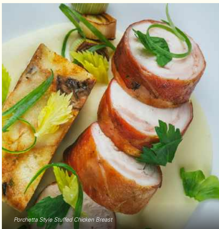
Porchetta Style Stuffed Chicken Breast