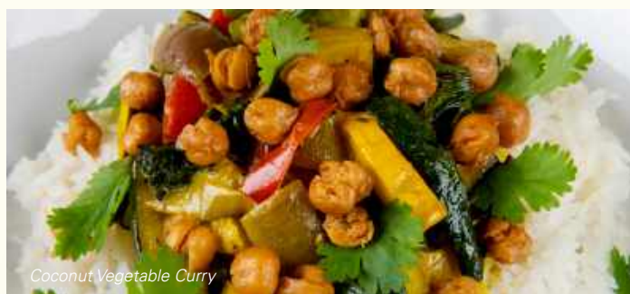
Coconut Vegetable Curry

Swiss Chard, Braised Mushroom, Pine Nut, Pecorino & Brown Butter Velouté