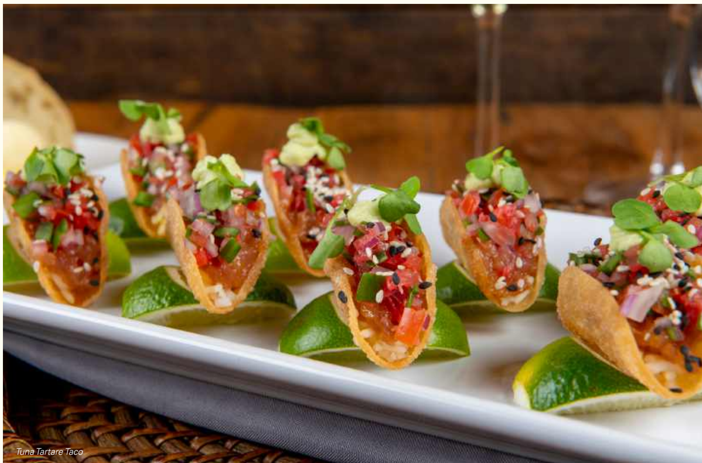
Tuna Tartare Taco