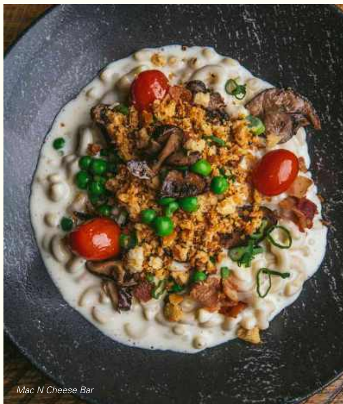
Mac N Cheese Bar

Elbow Macaroni in a White Cheese Béchamel Green Onions, Bacon, Green Peas, Sautéed Mushrooms, Garlic Bread Crumbs, Blistered Tomatoes & Hot Sauce